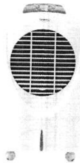
Symphony Sumo Model Registration No. 227069